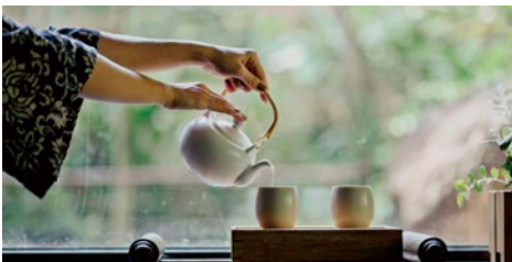
Top: Haedong Yonggungsa Temple | Above: Tea ceremony