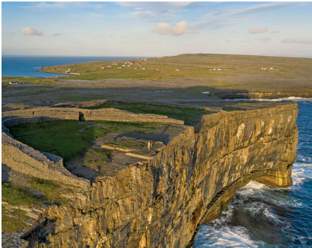
Dun Aengus, Inishmore, Aran Islands