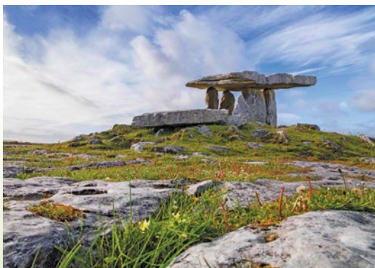
Poul nabrone Dolmen, The Burren

At the Clare Heritage and Genealogy Center, hear