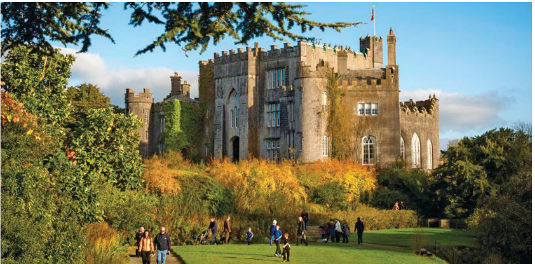
Birr Castle, Gardens & Science Center