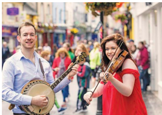
Top: Footpath along the Wild Atlantic Way