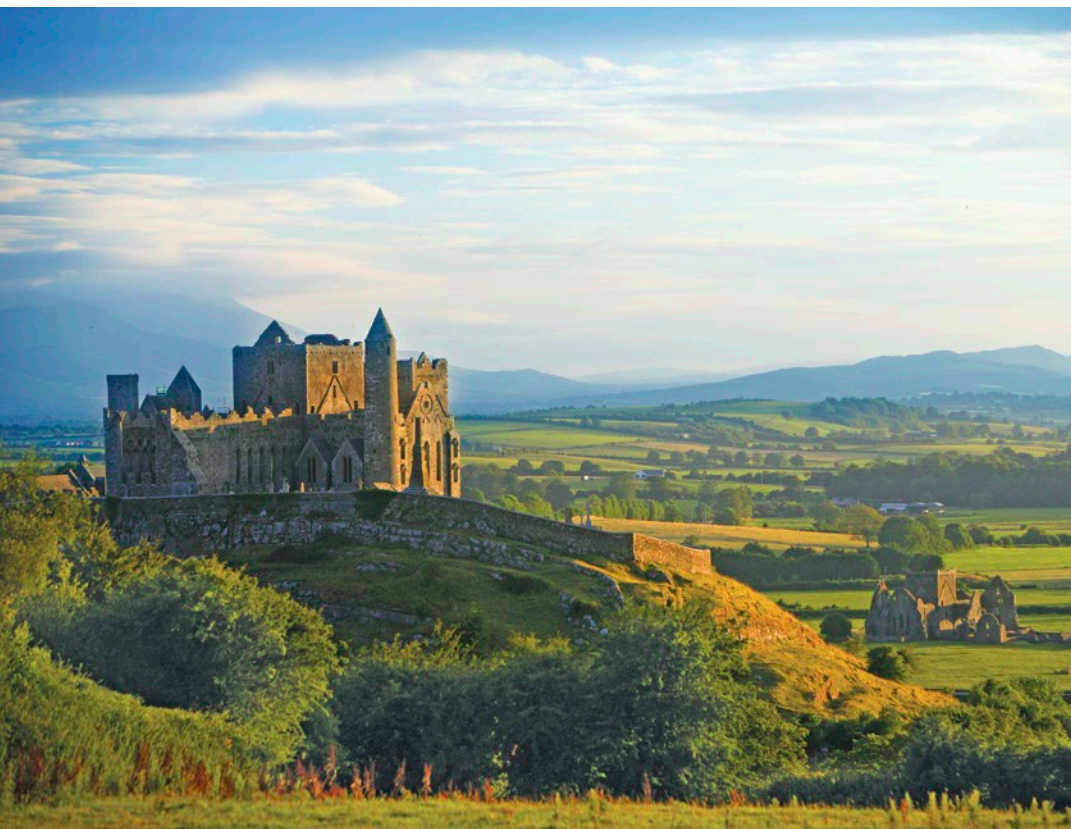
Rock of Cashel

before rejoining your group for a tasty lunch.