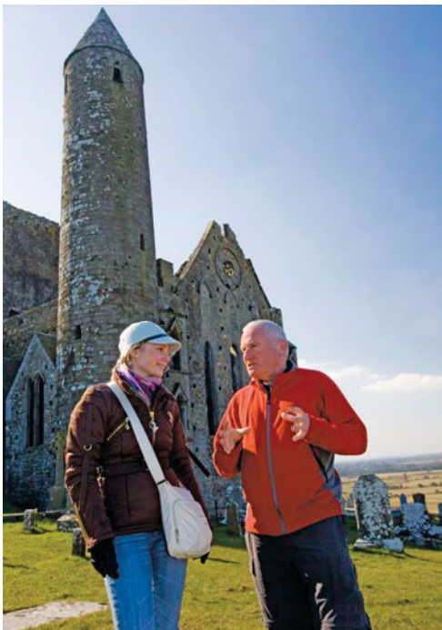
Left: Guide, Rock of Cashel | Below: Thoor Ballylee