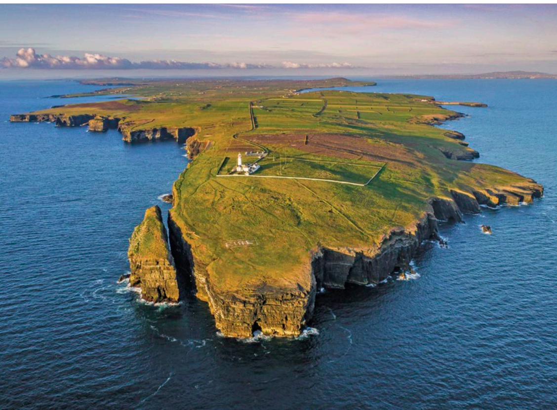
Loop Head Lighthouse, Loop Head Peninsula

the story of Irish emigration to the United States and get tips on researching your own family tree.