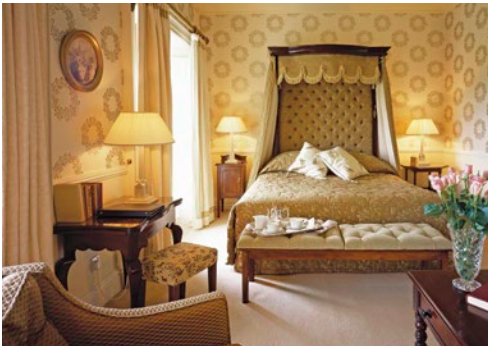
Longueville House | Mallow