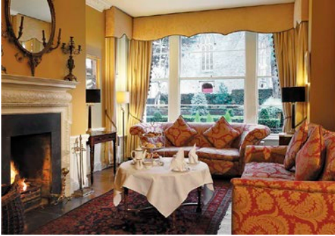
Old Ground Hotel | Ennis