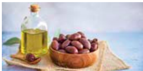
Top: Parthenon | Above: Olive oil & Kalamata olives