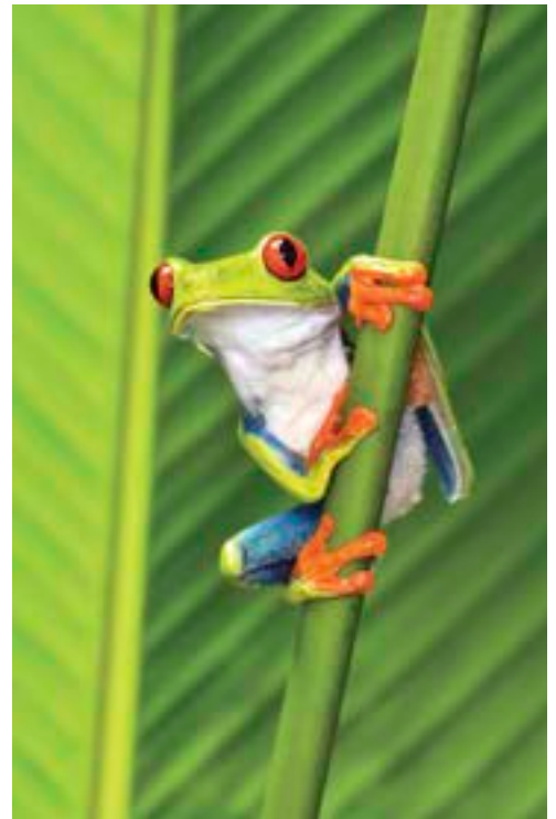
Red-eyed tree frog

Manatee Rescue Center. Meet these gentle creatures and learn about efforts to protect them at a conservation center.