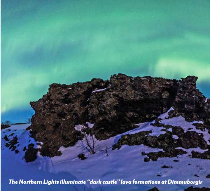
The Northern Lights illuminate “dark castle” lava formations at Dimmuborgir