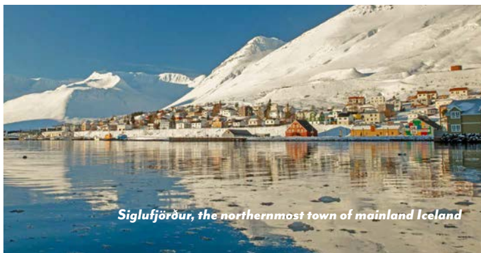
Siglufjörður, the northernmost town of mainland Iceland

Step into Siglufjörður’s past as a tiny fishing hub at the Herring Era Museum, featuring a restored salt house and factory. After, travel to Hauganes, a small fishing village on the western