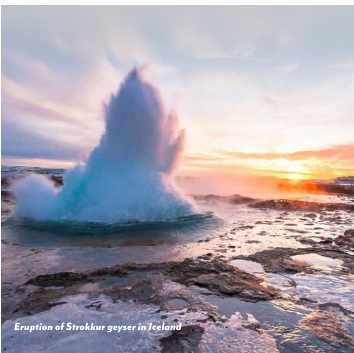
Eruption of Strokkur geyser in Iceland