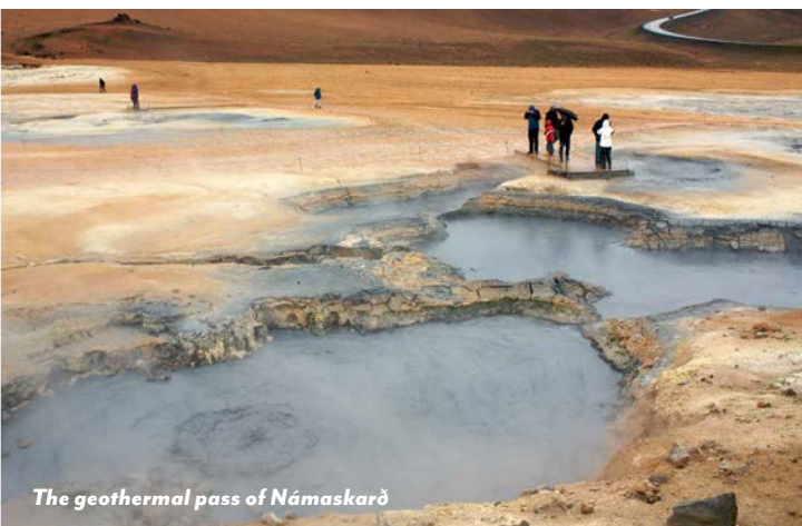
The geothermal pass of Námaskarð