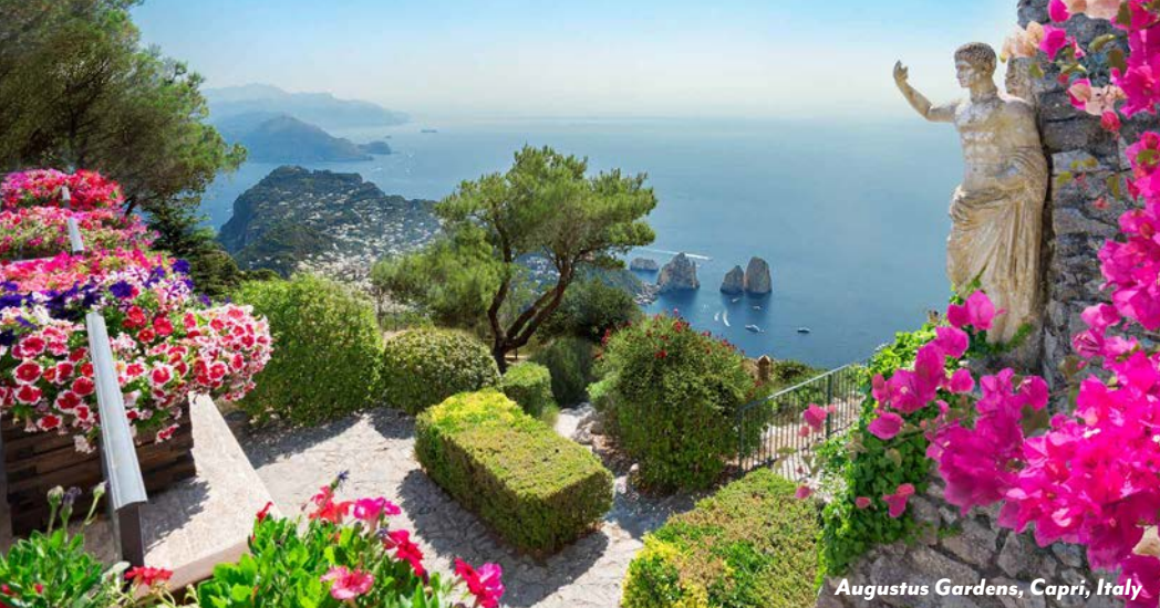
Augustus Gardens, Capri, Italy

Phoenician traders in the eighth century B.C. Visit Palermo's baroque square and the 12th-century Palermo Cathedral. Explore the sights and smells of revered Palermo street food at the Capo market and browse buzzing food stalls. After a lunch of popular local foods, enjoy your Traveler's Choice excursion. Select to visit the lauded Cathedral of Monreale, known for its Byzantine mosaics, or encounter the infinite beauty inside the historic Royal Palace and step inside the Palatine Chapel, a 12th-century masterpiece that reflects Sicily's diverse