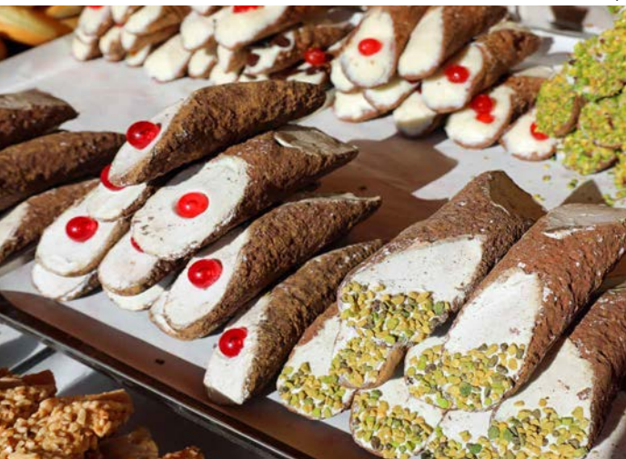
Cannolis, Palermo, Sicily

Giardini Naxos | Taormina From the port of Giardini Naxos, travel to Taormina, an ancient village on the top of a cliff above the Ionian Sea and near Mount Etna. Visit the remarkably preserved Greco-Roman Theatre, the world's most dramatically sited Greek theater that is still in use today, and explore the striking Corvaja Palace. You have the option to return to the ship for lunch or stay in Taormina for lunch and time to explore on your own.