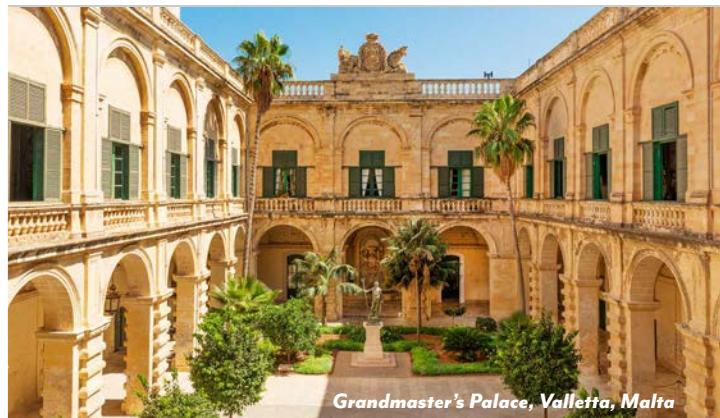
Grandmaster's Palace, Valletta, Malta