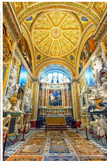
St. John's Cathedral, Valletta, Malta

Syracuse, Italy Travel to the small island of Ortigia, Syracuse's maritime heart. On a walking tour, behold the most ancient Doric temple in Sicily, the sixth-century B.C. Temple of Apollo, and visit the city's baroque cathedral that contains the ruins of a fifth-century B.C. temple dedicated to the goddess Athena. Later today, enjoy a Traveler's Choice excursion. You can visit the Neapolis Archaeological Park, which contains some of