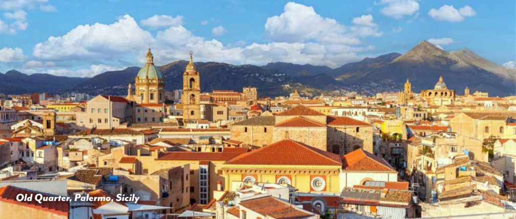
Old Quarter, Palermo, Sicily

Syracuse's most important ruins and the Teatro Greco or enjoy a slower pace by savoring wine tastings at a country winery in the rolling hills of the Val di Noto.