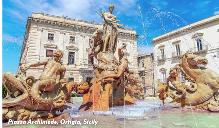
Piazza Archimede, Ortigia, Sicily