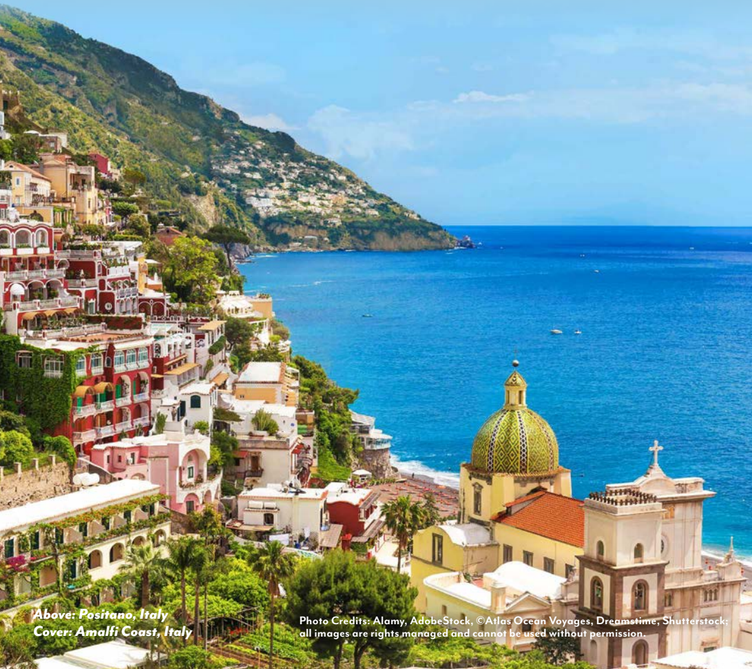
Above: Positano, Italy Cover: Amalfi Coast, Italy