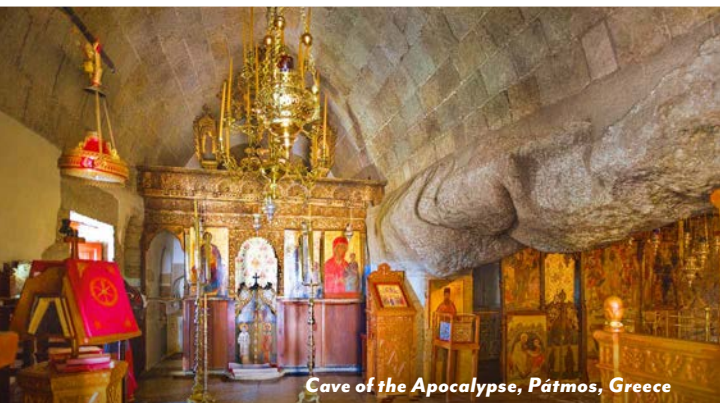
Cave of the Apocalypse, Pátmos, Greece