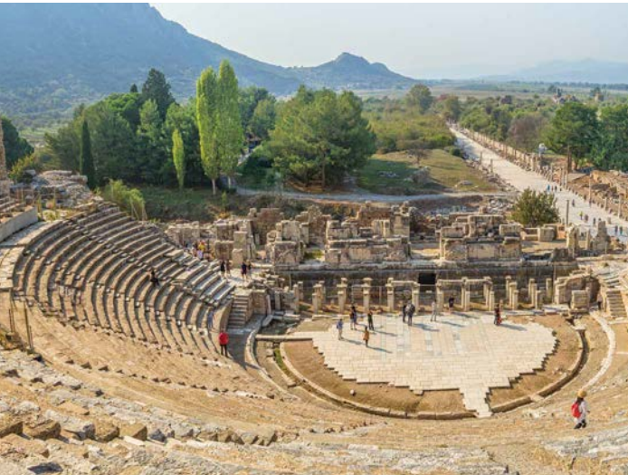
Great Theater, Ephesus, Turkey

Be on deck as your ship glides to breathtaking Santorini, one of the most iconic islands in the Aegean Sea. You'll be greeted by stunning whitewashed buildings perched above the sea and a caldera rising dramatically from the water. Some believe this location was the inspiration for the legendary lost city of Atlantis. From the port, drive to the southern end of the island to explore the prehistoric settlement of Akrotiri. Tour these