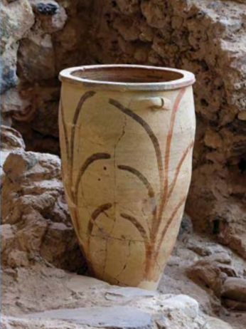
Akrotiri excavation site, Santorini, Greece

spectacular Minoan ruins, held intact by layers of pumice and ash for over 3,500 years.