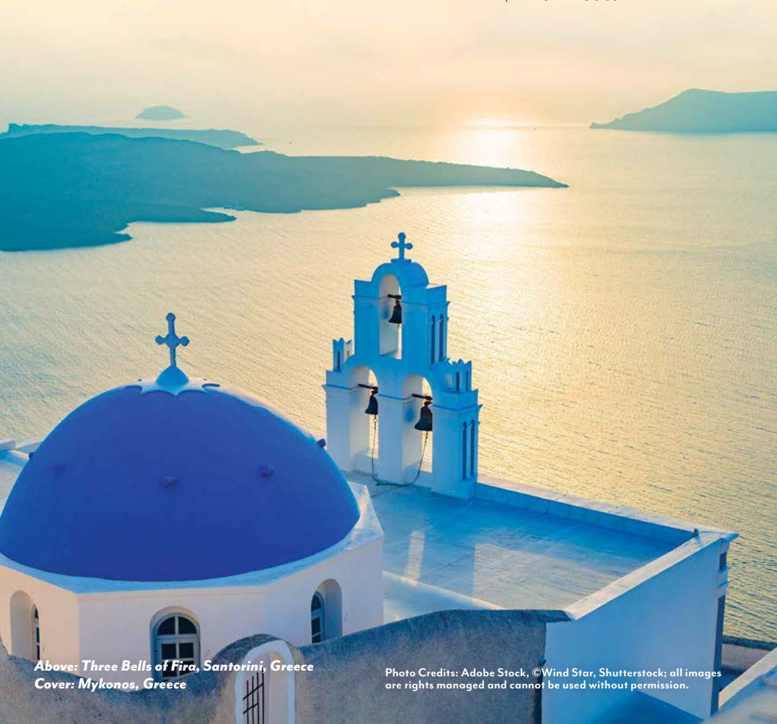
Above: Three Bells of Fira, Santorini, Greece Cover: Mykonos, Greece

Photo Credits: Adobe Stock, ©Wind Star, Shutterstock; all images are rights managed and cannot be used without permission.