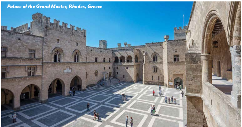
Palace of the Grand Master, Rhodes, Greece

For reservations, call Gohagan & Company at 800-922-3088 or visit colora.gohagantravel.com