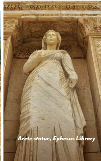
Arete statue, Ephesus Library