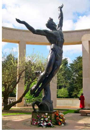
Normandy American Cemetery, France