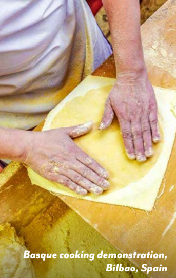
Basque cooking demonstration, Bilbao, Spain