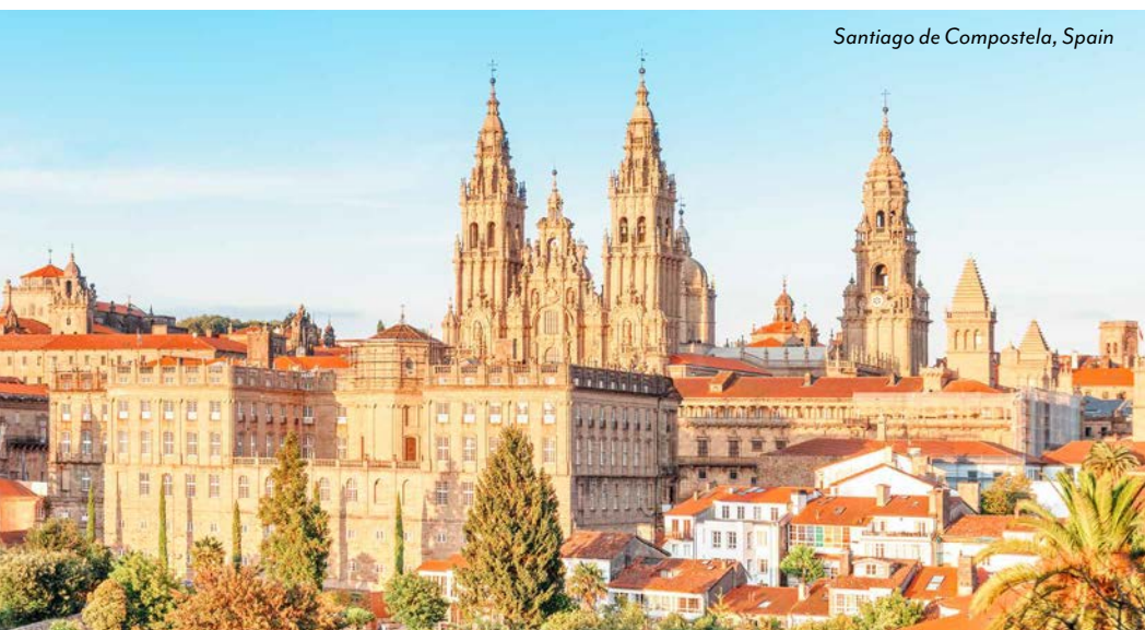
Santiago de Compostela, Spain

than 1,000 years. Rising from a tidal plain that appears to be suspended above the sea, this UNESCO World Heritage site is a vision of soaring spires isolated beyond a stretch of saltwater marsh. Cobblestone streets weave through the village, culminating at the Abbaye du Mont-Saint-Michel, a three-story Gothic masterpiece. Admire the serene cloisters, barrel-roofed réfectoire and Salle des Hôtes of the 13th-century La Merveille and the magnificent Église Abbatiale.