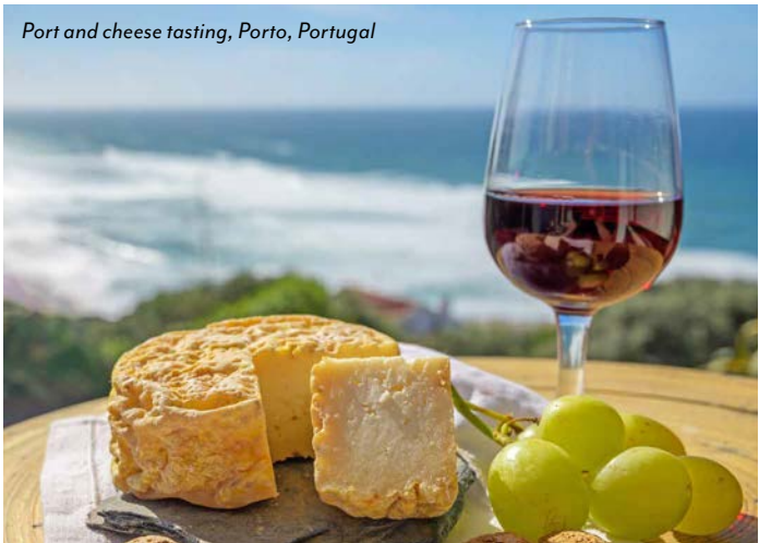
Port and cheese tasting, Porto, Portugal

Santiago de Compostela has been a world-renowned pilgrimage site since the 9th century when a light was seen shining over a forgotten Roman tomb believed to be that of St. James the Great. Stroll along stone streets to the Praza do Obradoiro square, where you may admire the splendid Palacio de Rajoy. Visit the hallowed sanctuary of Spain's patron saint — a legendary cathedral that holds the remains of St. James. Marvel at the ornate blend of styles on its interior, ranging from Romanesque to baroque.