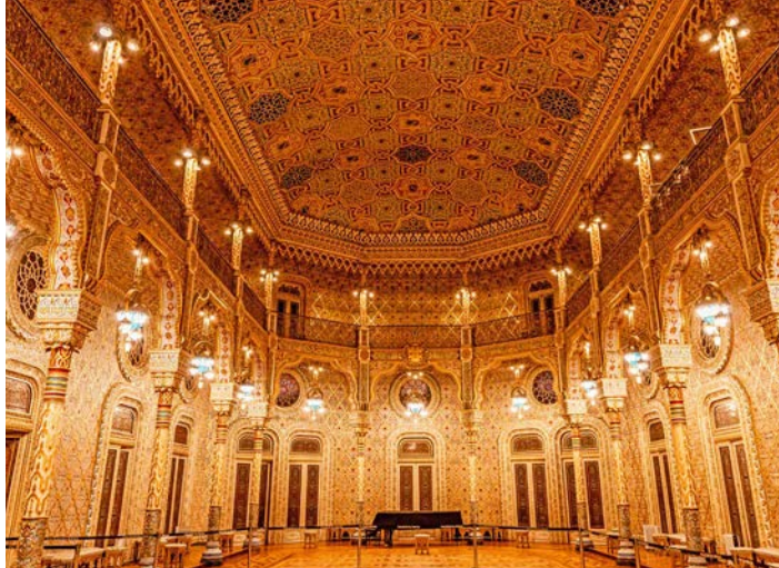
Stock Exchange Palace, Porto, Portugal