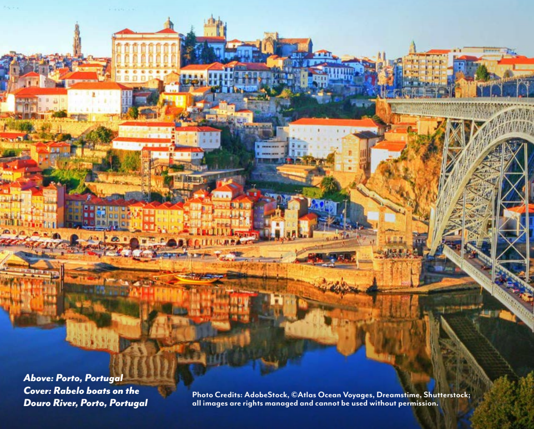
Above: Porto, Portugal