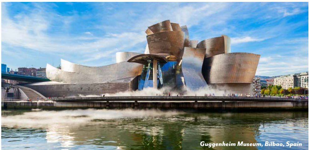
Guggenheim Museum, Bilbao, Spain

For reservations, call Gohagan & Company at 800-922-3088 or visit gohagantravel.com/reserve