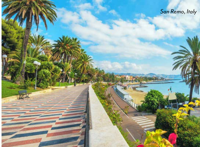
San Remo, Italy

your own plans for lunch. This afternoon, embark the deluxe Sea Cloud Spirit , a unique, luxurious tall ship.