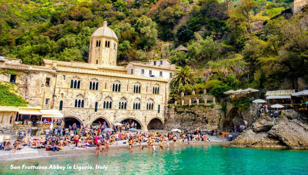
San Fruttuoso Abbey in Liguria, Italy

super-yachts, and the tiny, cobbled streets boast high-end boutiques. Despite being the filming location for many movies, the village retains its natural charm.