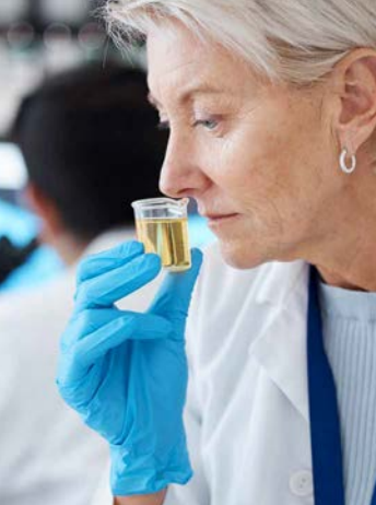
Create your own perfume in Grasse, France