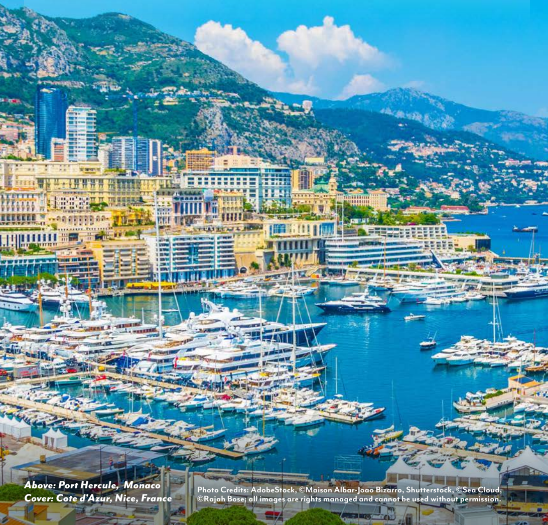
Above: Port Hercule, Monaco Cover: Cote d'Azur, Nice, France

Photo Credits: AdobeStock, ©Maison Albar-Joao Bizarro, Shutterstock, ©Sea Cloud, ©Rajah Bose; all images are rights managed and cannot be used without permission.