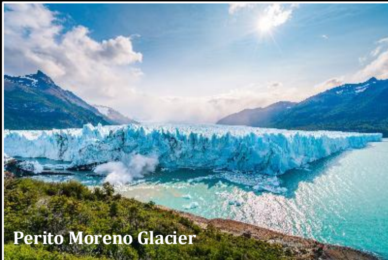
Perito Moreno Glacier