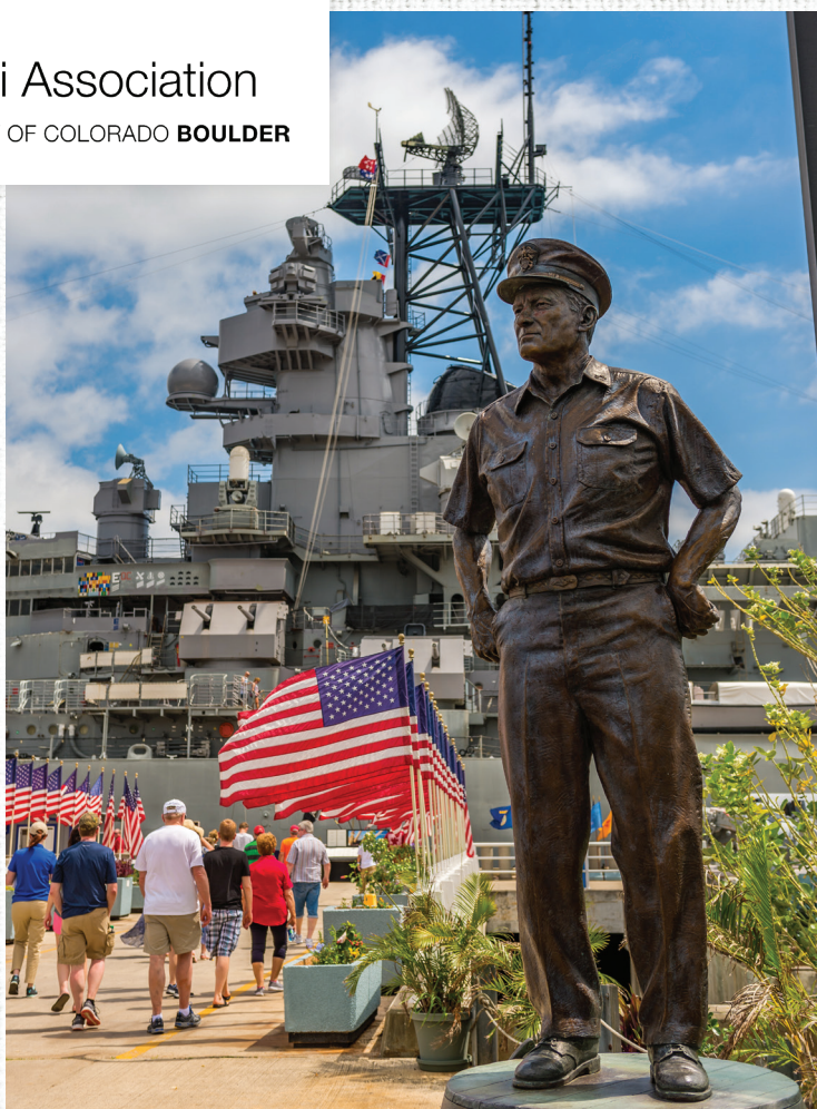
Statue of Admiral Chester W. Nimitz standing near the entrance to the USS Missouri.