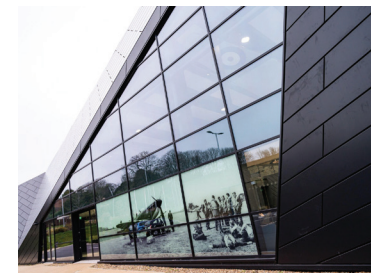
Battle of Britain Bunker