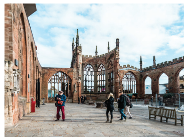
Cathedral Church of Saint Michael in Coventry