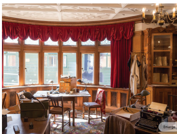
Bletchley Park Mansion