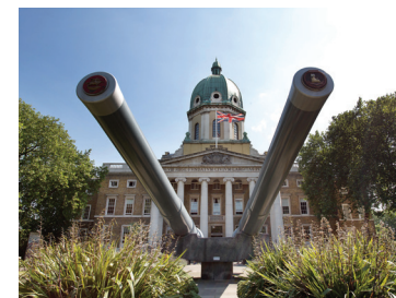
Imperial War Museum