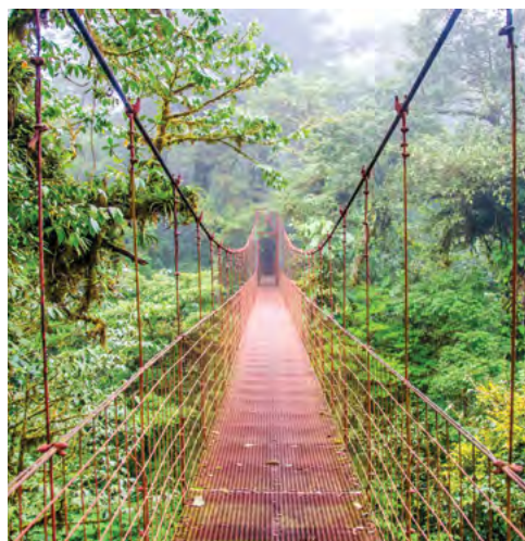
Suspension bridge in Tenorio Volcano National Park.

Venture to Costa Rica's remote Caño Negro district, celebrated for its prolific bird population and important wetland habitats. Enjoy a stylish glamping experience at Tocú Tent Camp, your home base, as you explore Tenorio Volcano National Park and its surrounding foothills, walk suspension bridges for an incredible bird's-eye view of the region's lush rainforests, and learn about the culture and cuisine of the Maleku people, Costa Rica's smallest remaining Indigenous tribe.