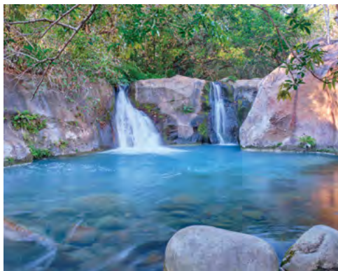
Las Chorreras waterfall.

With forests carpeting the sides of two active volcanoes, this area is alive with geothermal activity. Gurgling, bubbling mud pots spout, and steam rises above the canopy. Today, you can choose between several enticing options. Hike through the transition zone, where the tropical dry habitat meets the temperate cloud forest, for a chance to encounter mantled howler monkeys and the noisy white-throated magpie-jay. Opt for a shorter hike into the forest, followed by a swim below Las Chorreras Waterfall. Or choose to soar through the canopy by zip line. Afterward, enjoy a sumptuous lunch—including fresh ceviche—served poolside at Hacienda Guachipelin. (B,L,D)