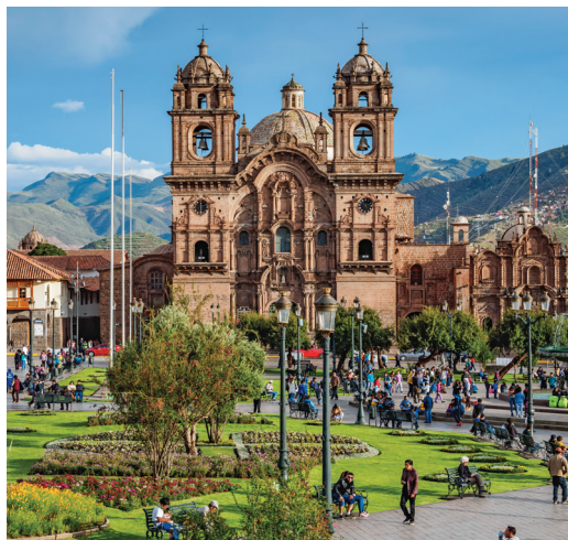
Cuzco, UNESCO site and former Inca capital

Day 11: Arrive U.S. We arrive in the U.S. today and connect with our return flight home.