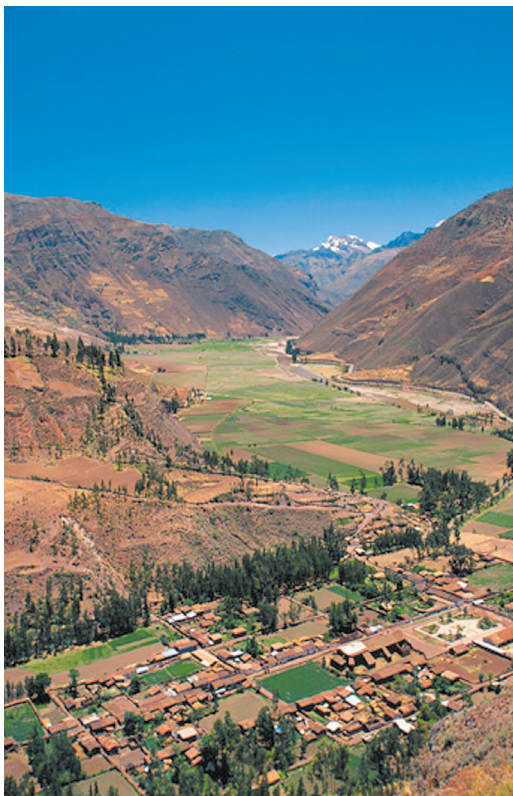
The beautiful and historic Sacred Valley