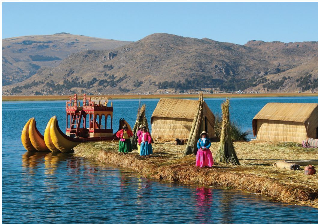
Local women on Uros Island

through the ruins and have the leisure to absorb the beauty and mystery of this haunting UNESCO World Heritage site. Mid-afternoon we return to Aguas Calientes and our hotel, with time at leisure before dinner together tonight. B,L,D