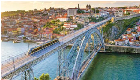
Top: Douro Valley | Above: Porto