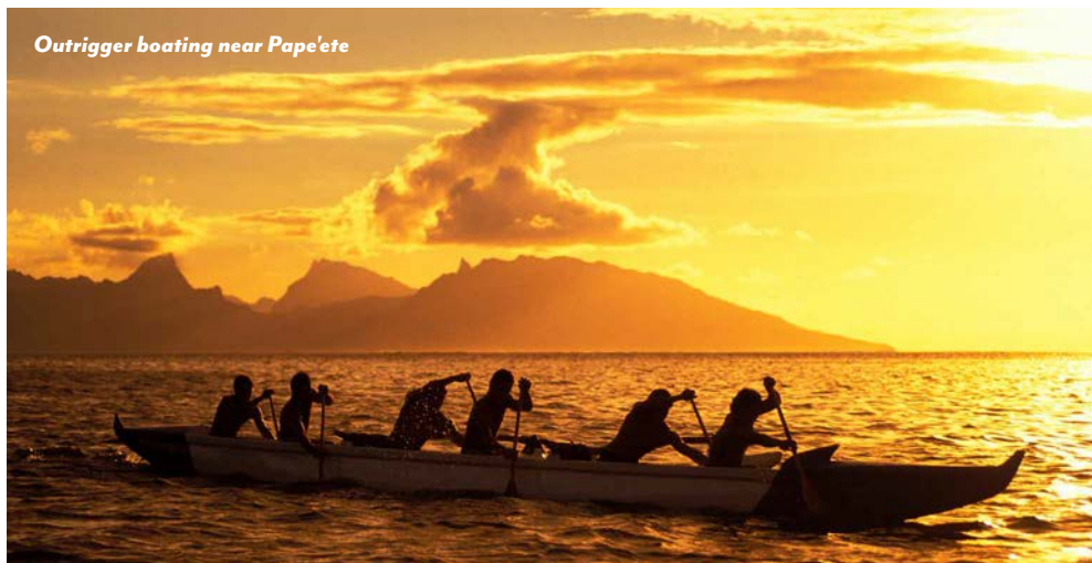
Outrigger boating near Pape'ete

For reservations, call Gohagan & Company at 800-922-3088 or visit gohagantravel.com/reserve