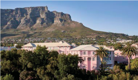
Belmond Mount Nelson Hotel | Cape Town