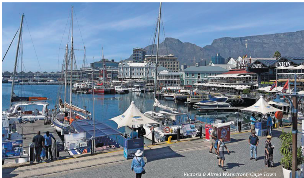
Victoria &amp; Alfred Waterfront, Cape Town