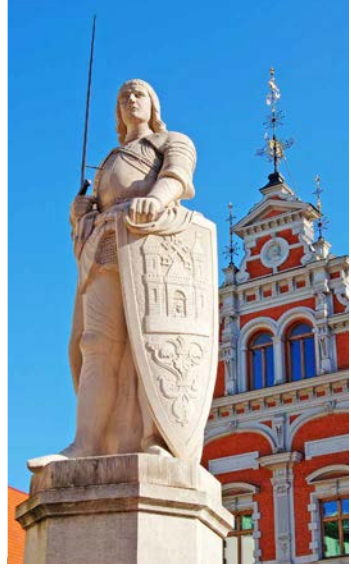
St. Roland Statue, Riga, Latvia

Disembark for your chosen excursion in Visby, a charming town on Sweden's largest island, Gotland. This well-preserved medieval town — dating back to the 12th century — is a UNESCO World Heritage site and is filled with natural beauty and ancient history. Choose to take a walking tour of the Old Town and the fascinating Gotlands Museum, or embark on a guided tour of the medieval sights — admiring the city walls, towers, alleyways and churches.