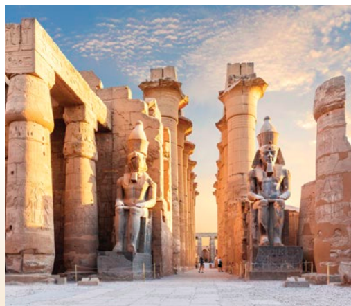
Temple of Luxor

Fly back to Aswan. The afternoon is at leisure. This evening, enjoy a celebratory Farewell Reception and Dinner on the ship, followed by a Dervish show and belly dancer performance.