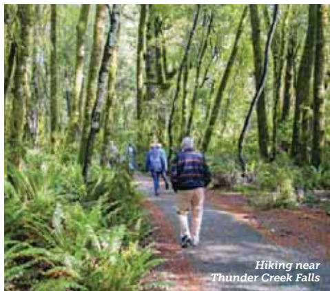
Hiking near Thunder Creek Falls