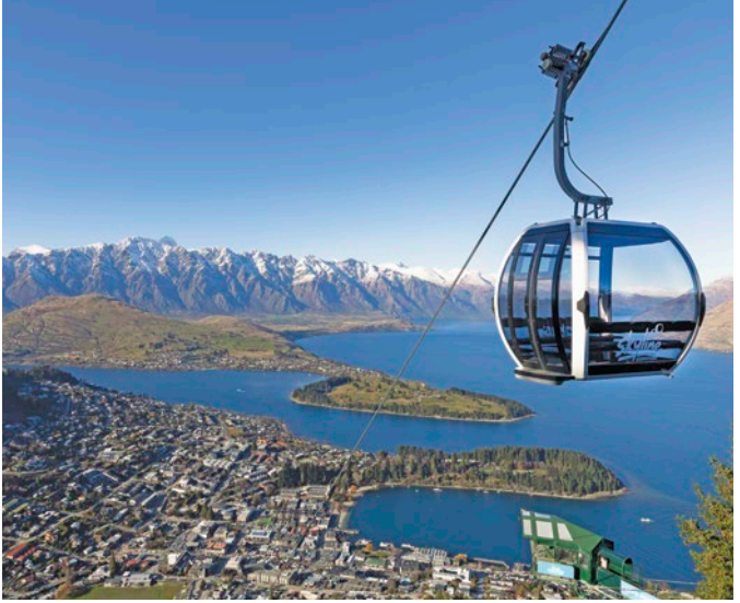
Gondola ride, Queenstown