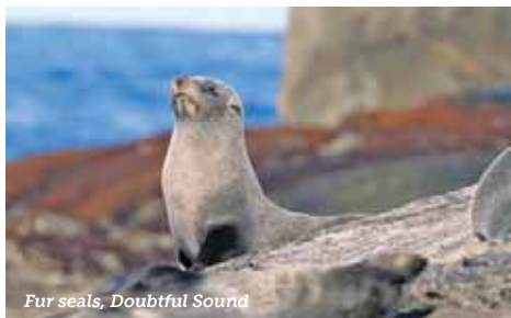
Fur seals, Doubtful Sound