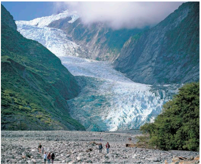
Franz Josef Glacier