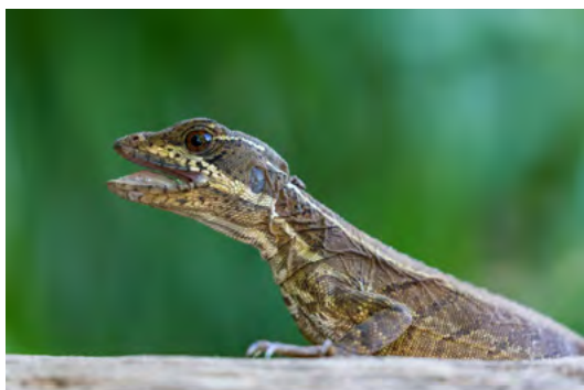
Adult female common basilisk on a branch.

This morning, arrive at Isla Iguana Wildlife Refuge. Once a U.S. Army bombing range, this protected area is home to black and green iguanas, sea turtles and several species of birds and tropical fish. There is time to enjoy the beach and snorkel. In the afternoon, visit the mainland for a Spanish heritage cultural experience in the town of Pedasí on the scenic Azuero Peninsula. (B,L,D)