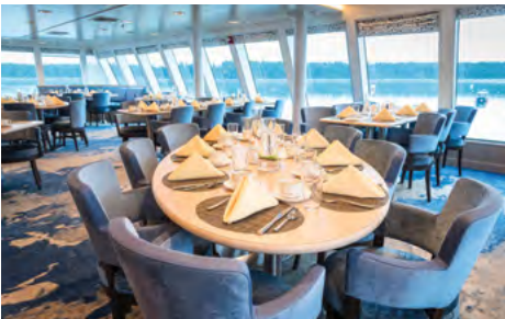
The casual dining room with its expansive windows.

Served in single seatings with unassigned tables for an informal atmosphere. Cuisine is fresh, sustainable, accented with regional flair and served plated.