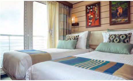
Category 4 cabin with single beds (which can be converted to a queen) and a private step-out balcony.