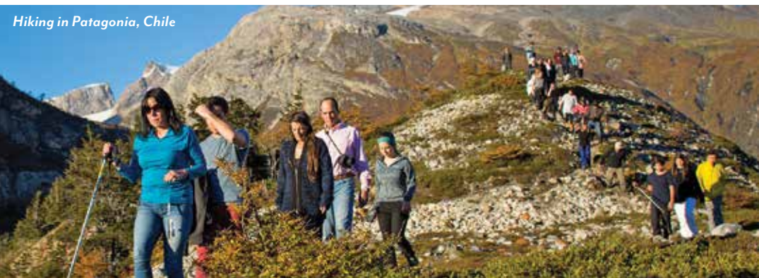
Hiking in Patagonia, Chile