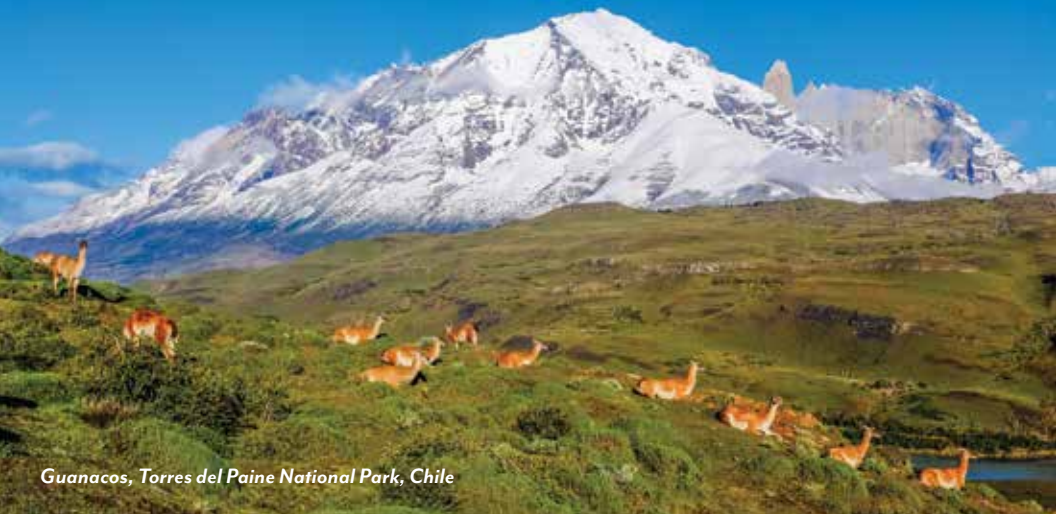
Guanacos, Torres del Paine National Park, Chile