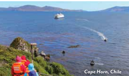
Cape Horn, Chile

While sailing toward Indonesia's fabled Spice Islands in 1520, Portuguese explorer Ferdinand Magellan became the first European to enter the channel that would later bear his name. Along the south side of the strait, amid the world's southernmost forests, smoke rose from numerous native Selk'nam campfires, leading Magellan to name this island Tierra del Humo, "land of smoke," which Spain's King Charles V changed to the more poetic Tierra del Fuego, "land of fire." The northern side of the strait came to be known as Patagonia, "land of giants," for Magellan and his men's impression of the tall, indigenous inhabitants. Three centuries later, the HMS Beagle, under the command of Admiral Robert FitzRoy and with young naturalist Charles Darwin on board, became the first ship to sail east to west through its namesake channel. Experience the same wonder of these intrepid explorers as you cruise through these mesmerizing landscapes almost untouched since Magellan explored them nearly 500 years ago.