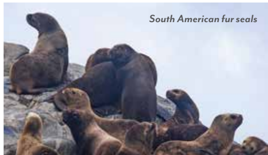
South American fur seals