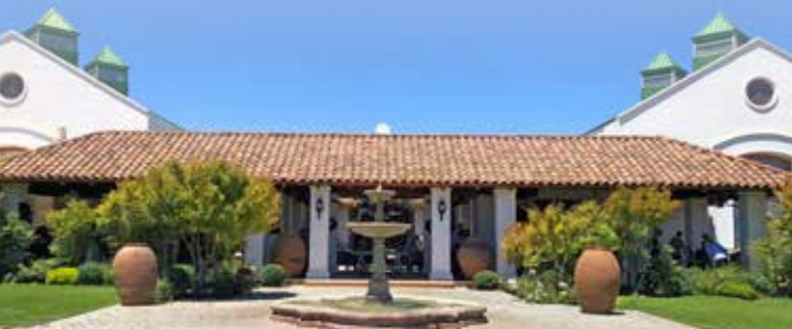
Casas del Bosque Winery, Chile

With Chile's variety of pleasing wines, from classic terroir-driven wines to obscure Marselan grapes and delectable dessert wines, wine debutants and oenophiles alike can sip, savor and return home with excellent memories.