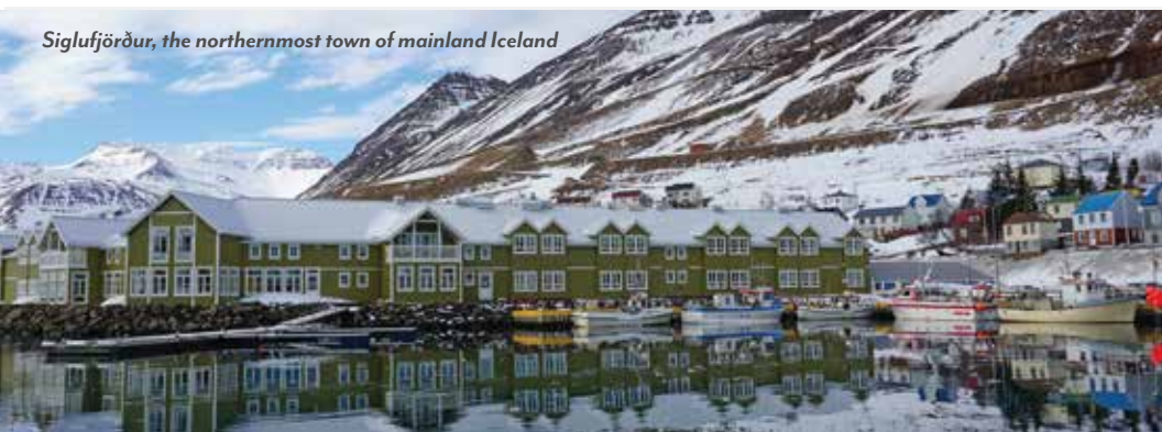
Siglufjörður, the northernmost town of mainland Iceland

Transfer to the airport for your flight back to your home city. (B)