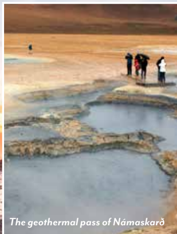
The geothermal pass of Námaskarð

Feast your eyes on the sky in search of the naturally occurring aurora borealis, more commonly known as the Northern Lights. This luminous spectacle is caused when streams of plasma escape the sun's surface and disrupt Earth's magnetic field, resulting in a multi-colored, shimmering night sky above the planet's polar regions. Seek this phenomenon of Mother Nature along with other geological wonders of Iceland, home to 4,500 square miles of glaciers, 30 active volcanic systems, 800 hot springs and more than 10,000 waterfalls.