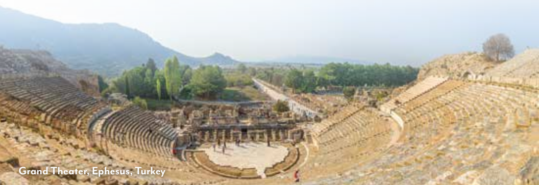
Grand Theater, Ephesus, Turkey

The Roman writer Cicero observed of Athens that “wherever you set your foot, you encounter some memory of the past.” In Greece and Turkey, the stories of antiquity come to life. St. John the Apostle is believed to have penned the Book of Revelation on Patmos; the legend of the lost utopian city of Atlantis lives on in Santorini; and it is on these mythological islands that Odysseus sought redemption in the Underworld and where Orpheus retrieved his first love. Walk the Sacred Way of Delos and discover ancient Akrotiri — the “Minoan Pompeii.” Enjoy exclusive cultural enrichments, including a classical concert at the historical Caravanserai building in Kusadasi and a traditional Greek folklore performance on this immersive itinerary.