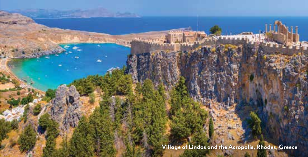
Village of Lindos and the Acropolis, Rhodes, Greece

Visit the Palace of the Grand Masters, a formidable Gothic castle that houses a treasure trove of art, furniture and icons from that era.