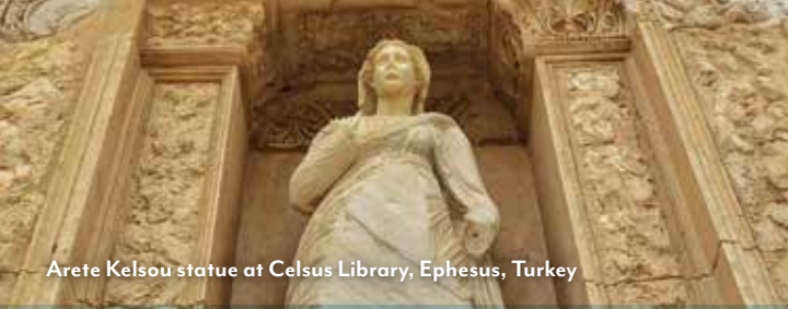
Arete Kelsou statue at Celsus Library, Ephesus, Turkey