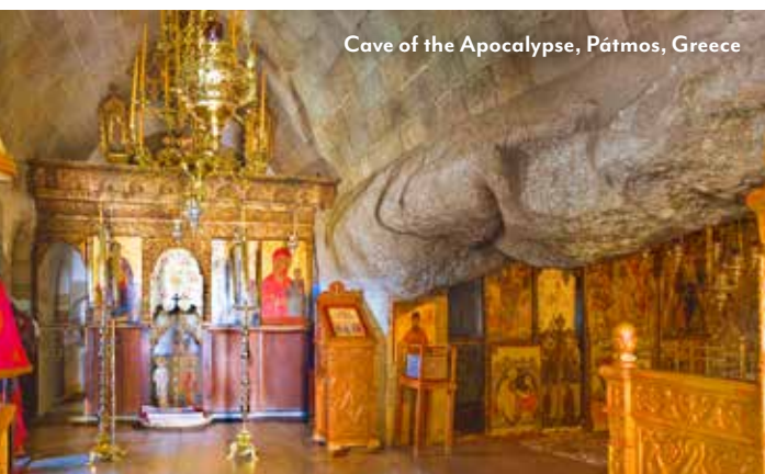
Cave of the Apocalypse, Pátmos, Greece

Explore the medieval old town as it was built by the Order of St. John, which occupied Rhodes from the early 14th century through the 16th century.