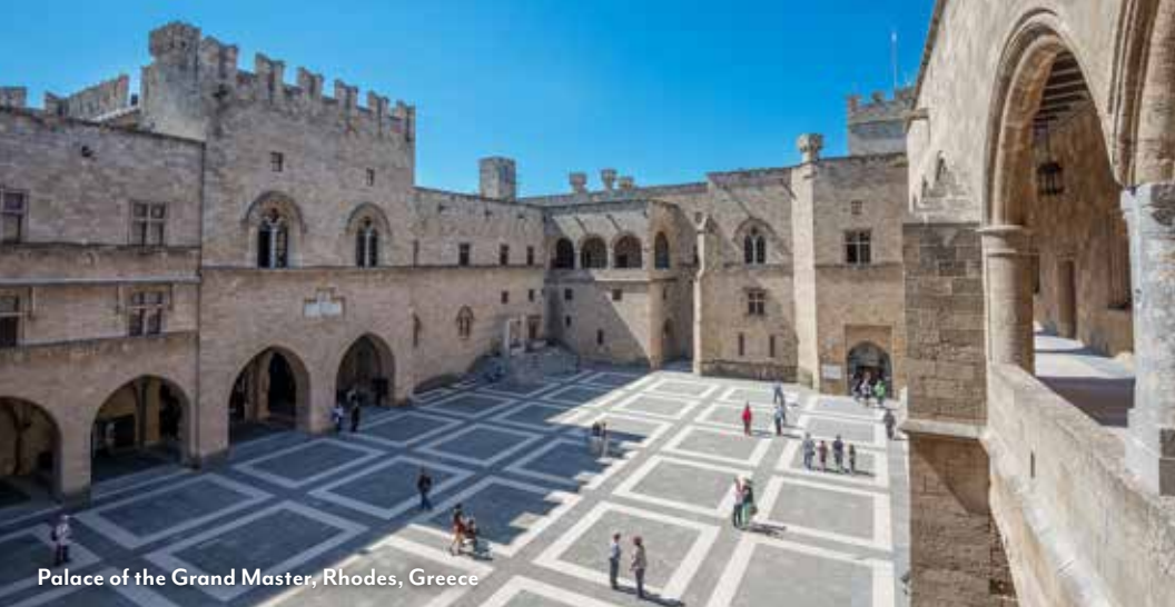
Palace of the Grand Master, Rhodes, Greece