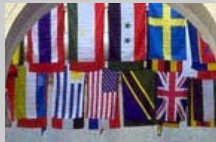
Many Transnational Corporations have greater income than entire nations