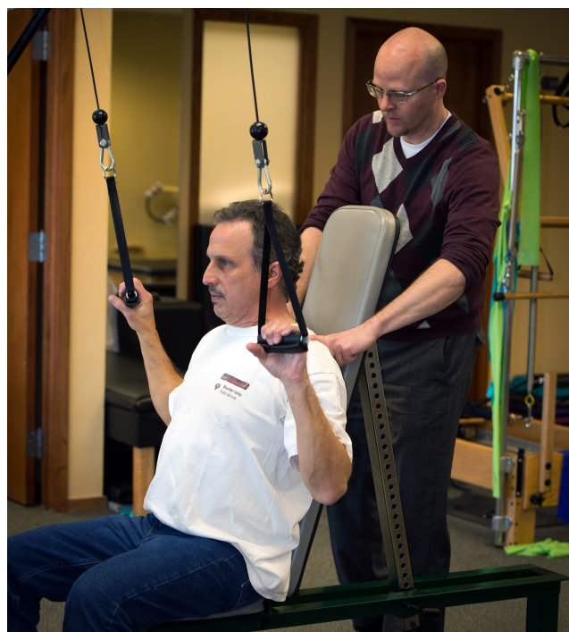
Helping a back surgery patient improve postural muscle strength