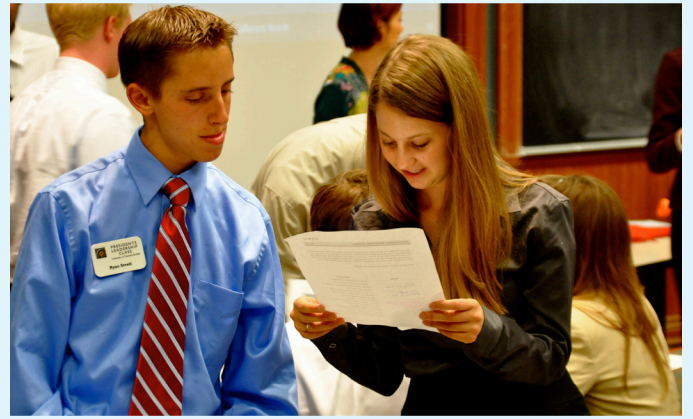
Tuesday Night Lecture

To develop extraordinary, ethical leaders for the betterment of individuals and society by promoting a broad, inclusive approach to leadership, fostering excellence in our exclusive academic competencies, delivering pioneering curriculum and experiential learning, leveraging the advantages of the university and the state of Colorado, and supporting our students with mentors, community, alumni, and financial resources.