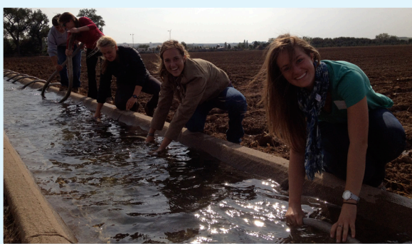
Agriculture Experiential Weekend