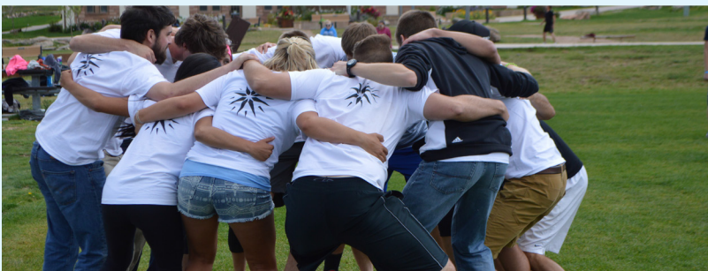
Orientation 2014 Staff Team