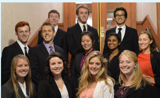
Thursday Recitation Group