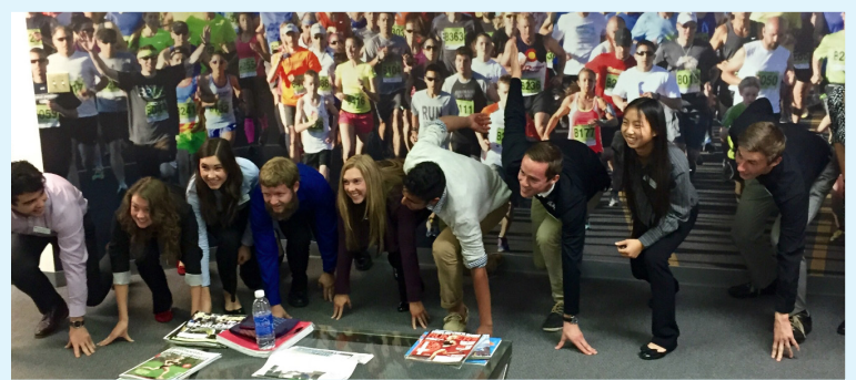
Sports Tourism Experiential Weekend