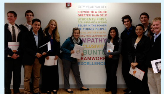
Education Experiential Weekend