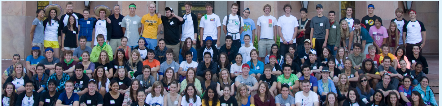
Orientation 2010 Group Picture

Experiential learning is a hallmark of PLC and sets our students apart from those in other leadership development programs. Experiential learning will accelerate your classroom learning when you integrate it with your real-world opportunities. Our program intentionally engages you with the world through Experiential Weekends, the Walkabout program, Professional Development offerings, and the Applied Leadership Wilderness Program. You will learn how to effectively plan, develop goals, implement ideas into action, and lead others in order to impact your community and become a global citizen.