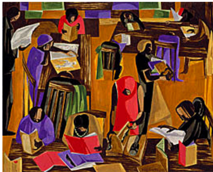
The Library -- Jacob Lawrence 1960

The famous painting The Library by noted African American artist Jacob Lawrence* was stolen from the National Museum of American Art.