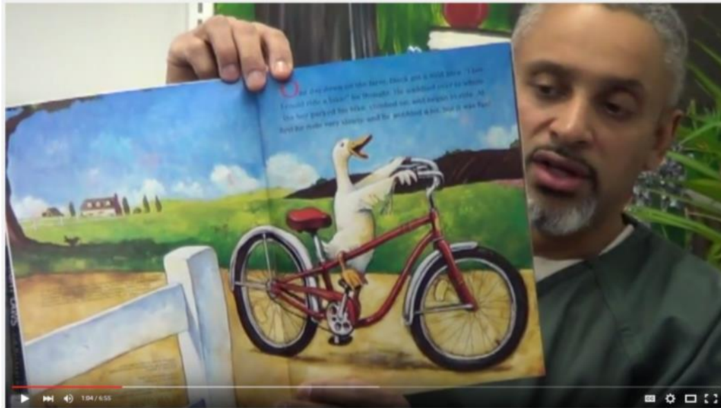
Read to the Children One Book 4 Colorado 2013