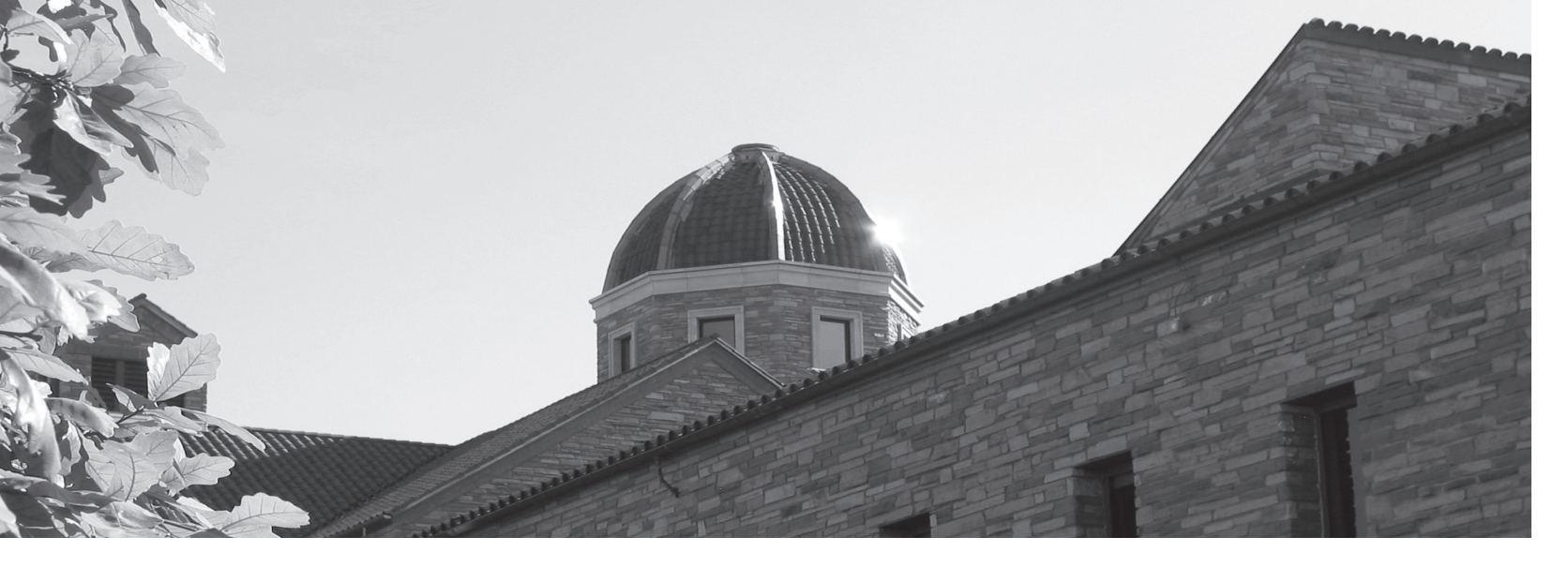
Beta Gamma Sigma

Membership in Beta Gamma Sigma (BGS) is the highest recognition a student can receive in a program in business or management. To be eligible for membership, a student must rank in the upper twenty percent of the graduating master's class.