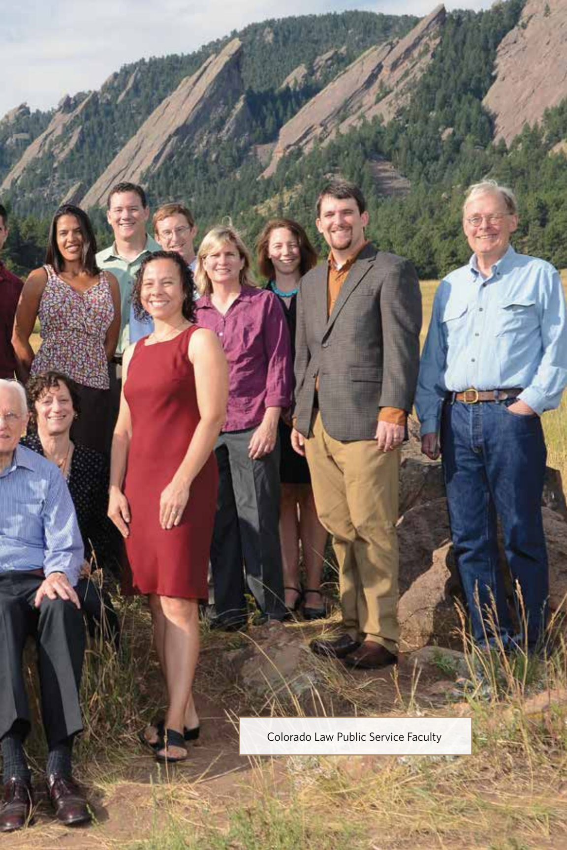
Colorado Law Public Service Faculty