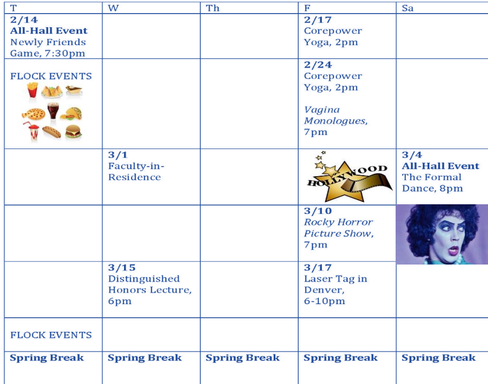
HONORS RAP Events Calendar, February-March