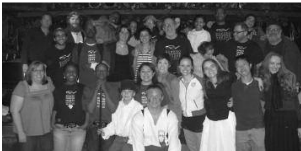
The Romero Theatre Troupe, 2009