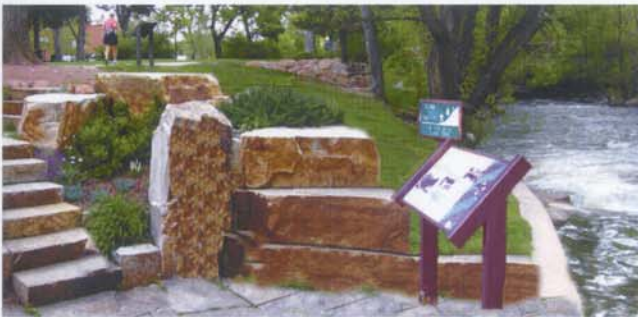
Examples of rock-work and interpretive signs.

The site will provide a comfortable contemplative spot and information about