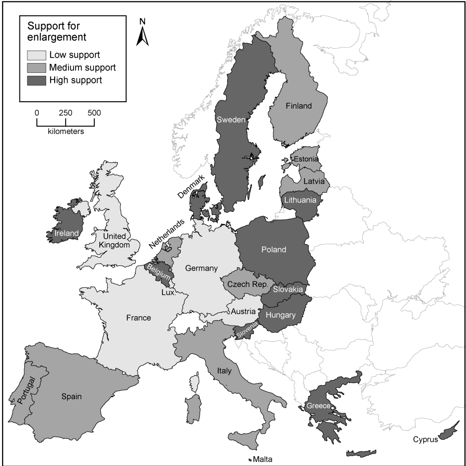
Fig. 2. Levels of support for EU enlargement (aggregate score on three Eurobarometer, 2006 survey questions designed to gauge general reactions to enlargement; see text for details).

category, the total would be three. If they were in the above-average category for each of the three questions, the total would be nine.