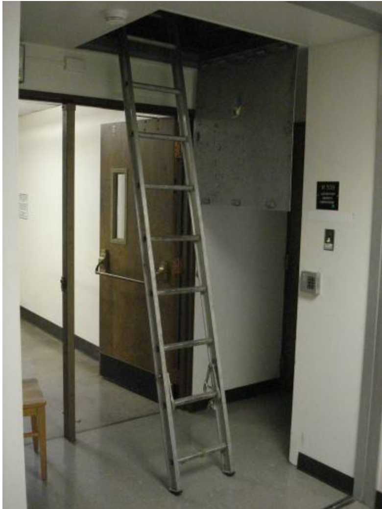
Existing Access Hatch to Upper Level