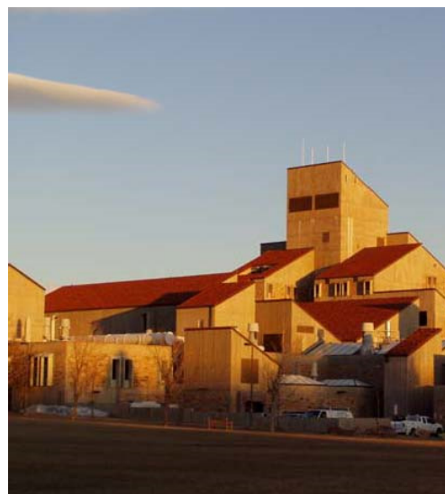
The Engineering Center at the University of Colorado at Boulder

To address these challenges, environmental engineers often encounter challenging problems that must be solved in data-poor situations as members of multidisciplinary teams. Environmental problems require creative solutions with contributions from scientists, lawyers, business people, and the public. Good communication skills, as well as technical proficiency, are essential for success in this arena. In addition, technology designed to address environmental problems is marketed globally, opening up increasing opportunities for international work in the environmental engineering field.