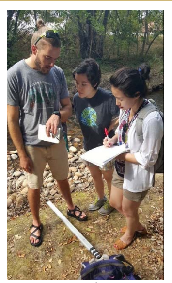
EVEN 4100: Ground Water Sampling, Fort Collins, CO.

Students must successfully complete all prerequisite courses before enrolling for a required course in the Environmental Engineering curriculum. Students must also simultaneously enroll in and complete satisfactorily all co-requisite courses. Successful completion means receiving a grade of C- or better (some courses require a grade of C in prerequisites). Grades of D+, D, D-, F, IF, IW, P or NC do not satisfy this requirement. Successful completion of prerequisite and co-requisite courses will be monitored for all required courses in the Environmental Engineering curriculum. Students who do not successfully complete prerequisite and co-requisite courses must retake those courses before advancing in the curriculum. If a student registers for a course without satisfactorily