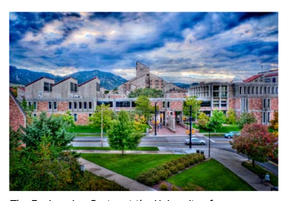
The Engineering Center at the University of Colorado at Boulder.

Environmental engineers play a vital role in maintaining the quality of both human environmental systems and the natural environment. Environmental engineering encompasses the scientific assessment and development of engineering solutions to environmental problems impacting the biosphere, land, water, and air quality. Environmental issues affect almost all commercial and industrial sectors, and are a central concern for the public, for all levels of government, and in international relations. These issues include safe drinking water, wastewater processing, solid and hazardous waste disposal, outdoor air pollution, indoor air pollution, transfer of infectious diseases, human health and ecological risk management, prevention of pollution through product or process design, and renewable and sustainable energy sources and their effects on the environment.