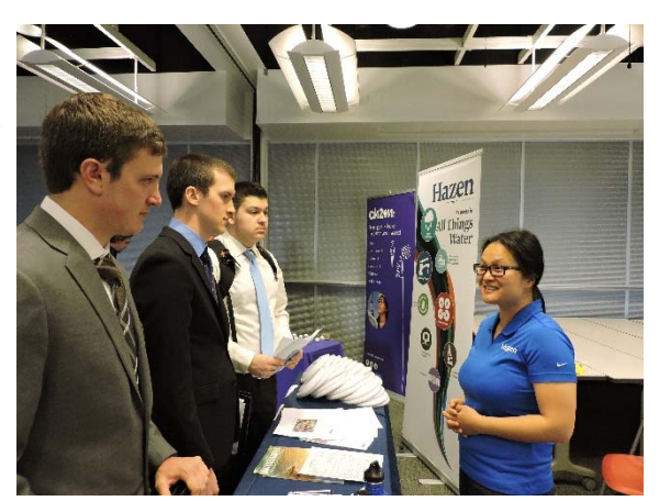
Environmental Engineering and Water Resources Networking Event, March 2017

Once the Office of Admissions has completed its evaluation, the student will meet with the EVEN Advisor for evaluation of transfer credits for the EVEN curriculum. Note that acceptance of transfer credits by the admissions office does not ensure that the transfer credits will count toward the EVEN BS degree; courses taken at another institution must match the course requirements for the EVEN curriculum. In many cases, identification of courses is straightforward; however, for some courses, the EVEN Director may request documentation of course content (catalog descriptions, course syllabi).