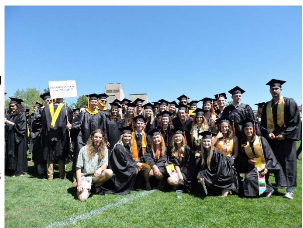
EVEN Graduation Class - May 2017