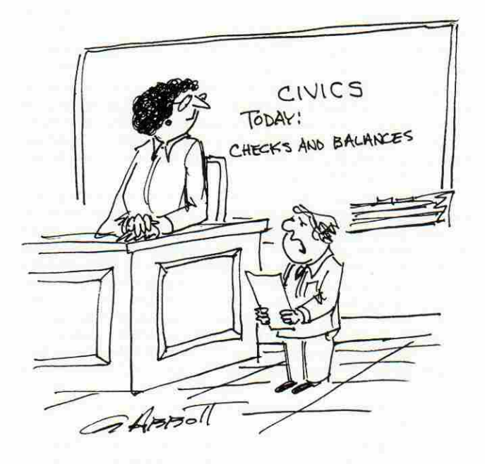
"These days, it seems, the political process runs to more checks and bigger balances."

Equity . One of the complaints frequently lodged against the choice system is that it is inequitable because it sets up unfair competition among BVSD schools. One solution is to level the playing field — for example, by permitting neighborhood schools to compete under the same set of rules as focus and charter schools. Although this would be an improvement, it implicitly concedes that competi-