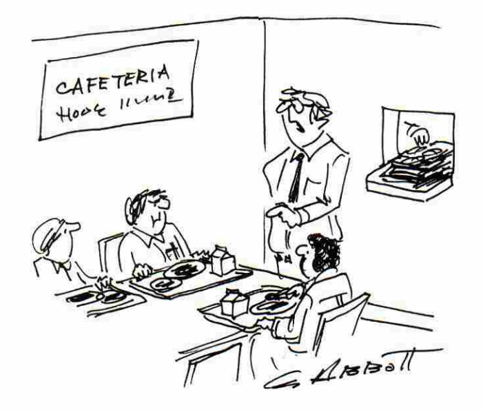
"You have not discovered a new life form. That's your lunch."

By contrast, people in the "new mission" choice schools had few concerns about unfair competition or the market imperative. They touted their high parental satisfaction ratings and saw "new mission" schools as raising achievement in the district overall. They also tended to see the claims about skimming and "white flight" as overblown or to attribute those phenomena to causes other than the expansion of choice, such as demographic shifts within the district.