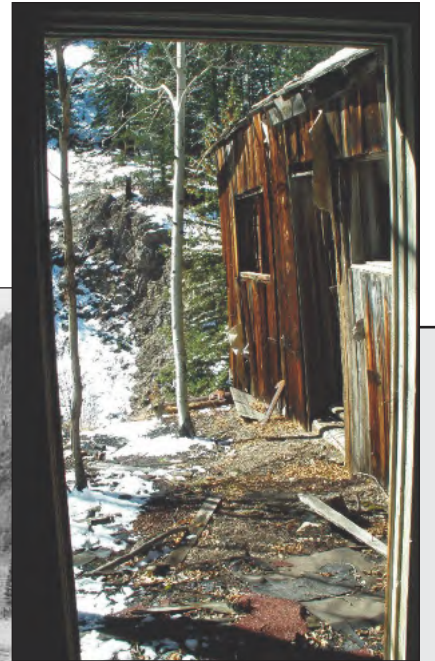
The Ute-Ulay and townsite contains many buildings built as far back as the 1870s. The Colorado Art Ranch is conducting a month-long project in Lake City to develop possible future uses for the area.

This all-day event will include a Welcome by Kye Abraham of LKA International and Closing Remarks /