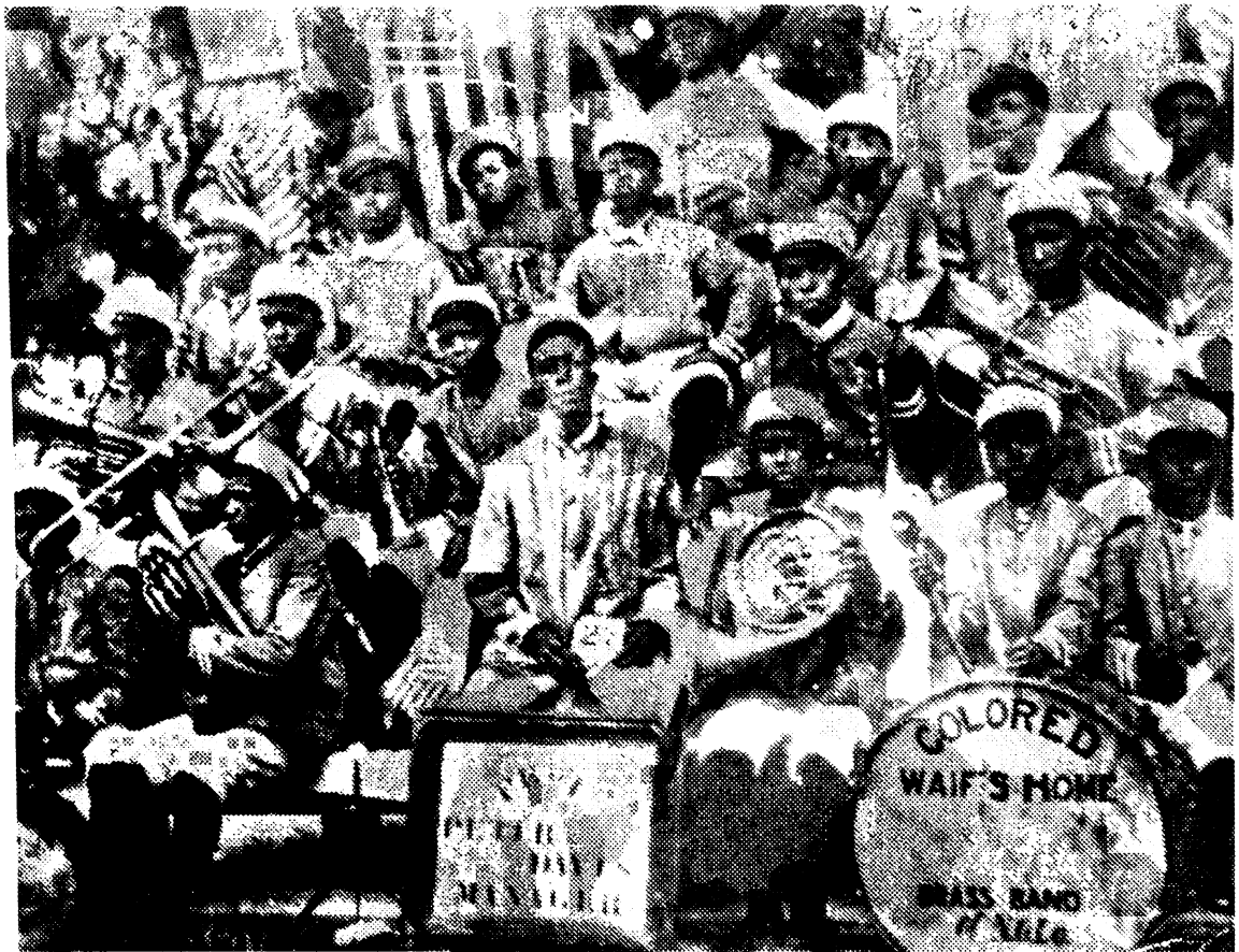
Figure 2. The brass band of the Colored Waif's Home, circa 1913. The arrow indicates a young Louis Armstrong in the third row.

ing his experience in the Waif's Home, Armstrong remembered that “the little brass band was very good, and Mr. Davis made the boys play a little of every kind of music.” Although from all accounts the band did not read sheet music, its sound ideal seems to have run not towards the barrel house style of the dance hall “routiners” but more toward the traditional fare of marches and sacred music, with the inclusion of a few popular ragtime numbers. In its performance practices, which thus to some degree mixed old and new currents in brass band work, the Waif's Home band, an ensemble of novices, reflected developments also beginning to flower among the best of the city's professional parade bands. 17