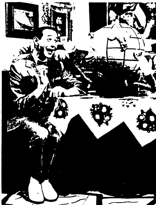
Man-Child in Toyland. TV's Pee-wee Herman, with friend Globey, epitomizes "PoMo" camp.

experience of aftermath, privatization, weightlessness: They can remember political commitment but were not animated by it—more, they suspect it; it leads to trouble. They cannot remember a time before television, suburbs, shopping malls. They are accustomed, therefore, to rapid cuts, discontinuities, breaches of attention, culture to be indulged and disdained at the same time. They grew up taking drugs, taking them for granted, but do not associate them with spirituality or the hunger for transcendence. Knowing indifference is