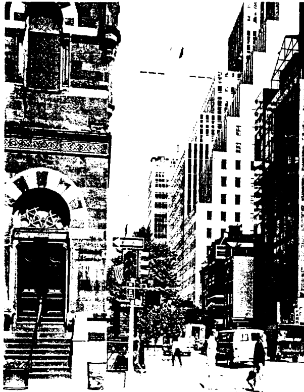
AT&T headquarters in New York City. Architects John Burgee and Philip Johnson abandoned "form-is-function" modernism for decorative postmodern flourishes.

In the postmodernist sensibility, the search for unity has apparently been abandoned altogether. Instead, we have textuality, a cultivation of surfaces endlessly referring to, ricocheting from, reverberating onto other surfaces. The work calls attention to its arbitrariness, constructedness; it interrupts itself. Instead of a single center, there is pastiche, cultural