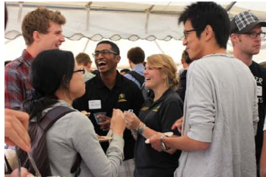
Students at Chancellors' Welcome for New International Students – September 6, 2011