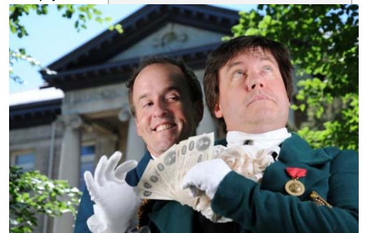
Photo from The Inspector General

The Office of International Education is here to help you give your programs an international dimension. CSF has provided a great model for international collaboration in the arts. The project was very rewarding for acting company and artistic staff, but was also a treat for the general public as a whole. Well done!