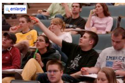
A new study shows University of Colorado at Boulder students who combine clicker use and peer discussions in classrooms learn more.