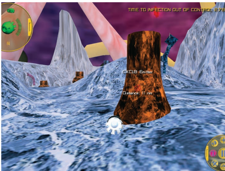
Fig. 3. Protein-sized drone flying over macrophage surface in Immune Attack (9). The player is required to call neutrophils by using the drone’s ray gun to activate CXCL8 release.

Games may also extend assessment into new areas. Whereas we say that we value 21st-century skills such as problem solving, teamwork, communication, and leadership, these essential traits are nowhere to be found on a modern transcript. An attractive dimension of game-based assessment is the potential to track sequences of user actions and communications, then map these onto higher-order