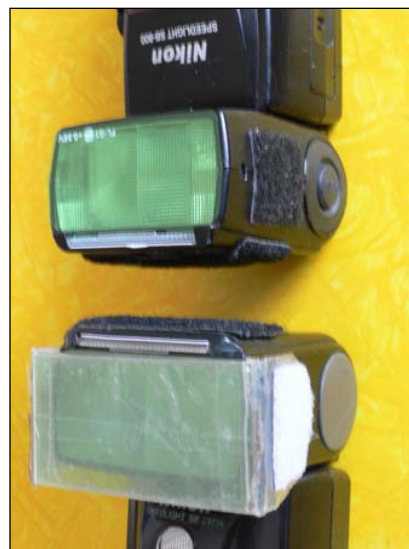
A simple diffuser cut from 3/4 of the side of a rubbing alcohol bottle and wrapped around the lens of the flash, far right.