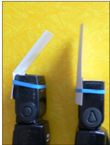
A flash with sync cord and built-in diffuser card, left. A single-ply toilet paper diffuser, center. Two white paper cards, right, one folder over to throw 90% of the light forward, and one upright to throw about 50% of the light to a ceiling and 50% forward to the subject. The upright flash would be to bounce the flash but fill eye sockets and add sparkle to eyes.