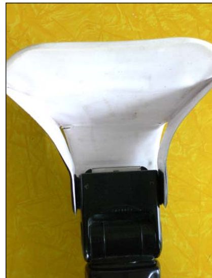
Alcohol-bottle-bottom and manufacturer diffuser cubes set upright to fill a room with light, left, and aimed at subject, center. Lumiquest Pocket Bouncer™ prefabricated diffuser designed to throw 100% or light forward, at right.