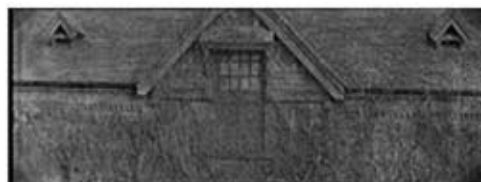
The Hyrcynium Wood , Ben Rivers 2003

The Hyrcynium Wood 2007 Sørdal 2008 A World Rattled of Habit 2008 Origin of the Species 2008 Total Running Time: 75 min.